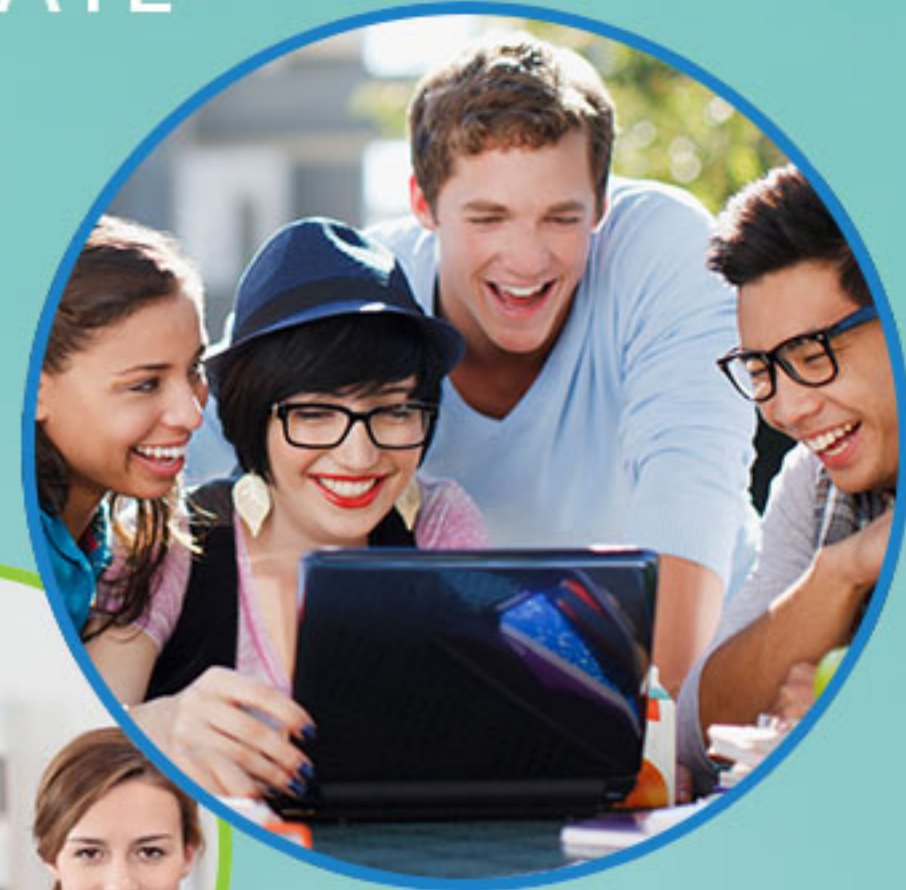
5th Year Students